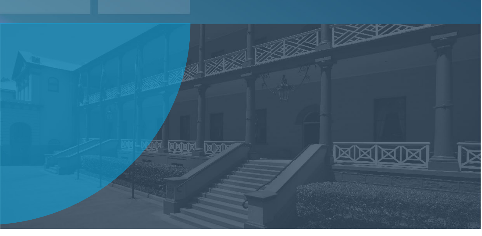
Report 5/57 - October 2022

2022 Review of the annual reports and other matters of the Office of the Advocate for Children and Young People and the Office of the Children's Guardian